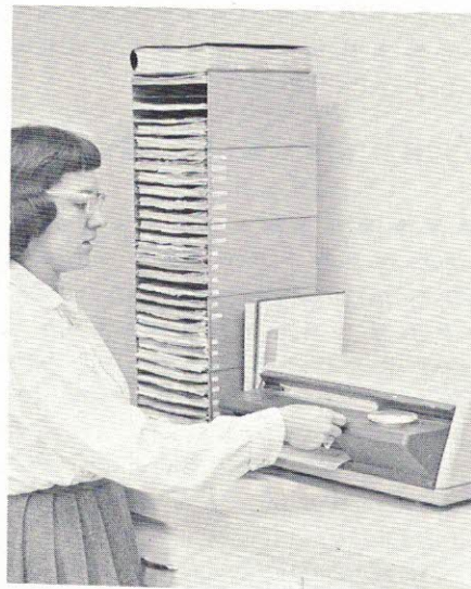
Reproductions by Thermo Fax.