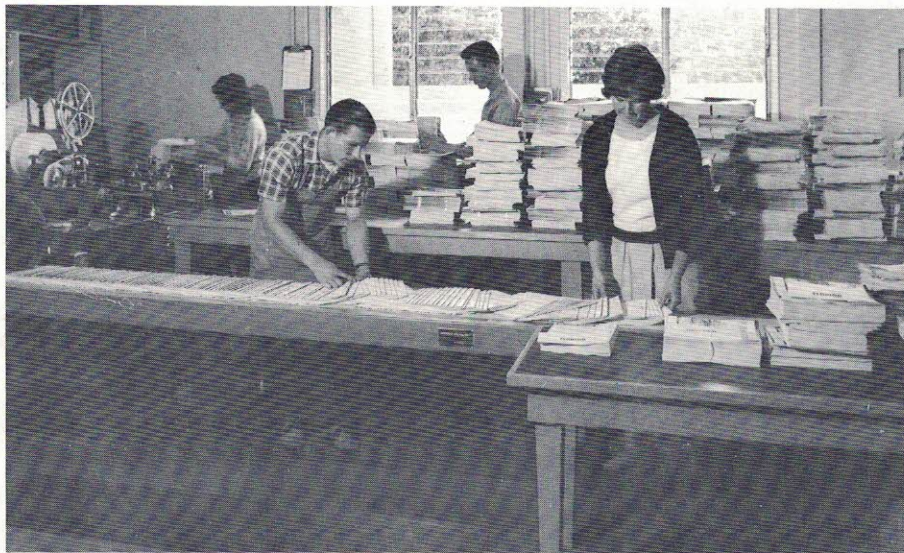
The PLAIN TRUTH mailing staff at work.

Lined up for the Octet this year are trips approximately once per month to outlying local churches to provide special music.