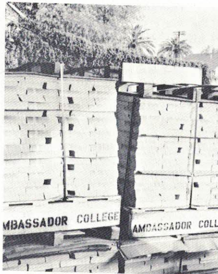
The PLAIN TRUTH on the receiving dock.

If you handed one sheet of paper to each man, woman and child in the United States you'd have a picture of how many printed sheets pass through the Supply Department in a normal year. And with the thirty percent increase steadily growing, in 2½ years you could include all of North America and still have sheets left over!