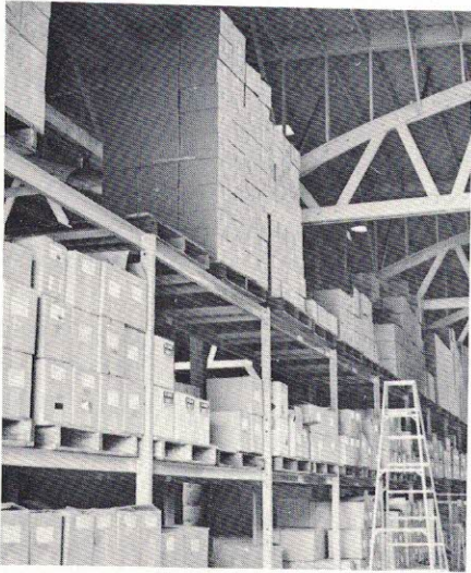
Literature in bulk held for mailing.

Everything from typewriter ribbons to filing cabinets flows through this section. Under its jurisdiction also fall the booklets, reprints, Correspondence Course, and other supplies on their way to the mailing office.